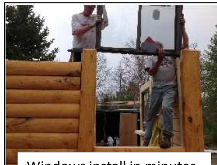
Windows install in minutes.