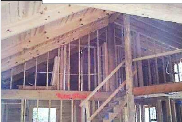
Interior rough walls for a custom 2-story Bob Cat model