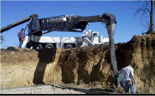
Installing a full basement foundation