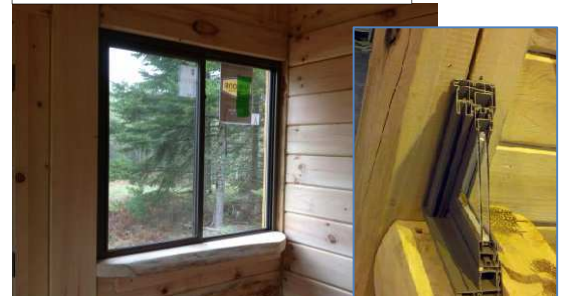
Decorative log sills included in Phase 1

Asphalt roofing shingles are included in the "Dry In" Phase 2 materials package. You will need to work with your Woody advisor to select roof color and style. See the available technical data sheets For details. Metal roofing is also a popular option and has advantages over asphalt shingles.