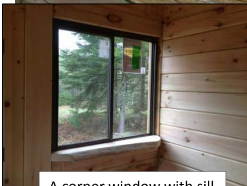
A corner window with sill