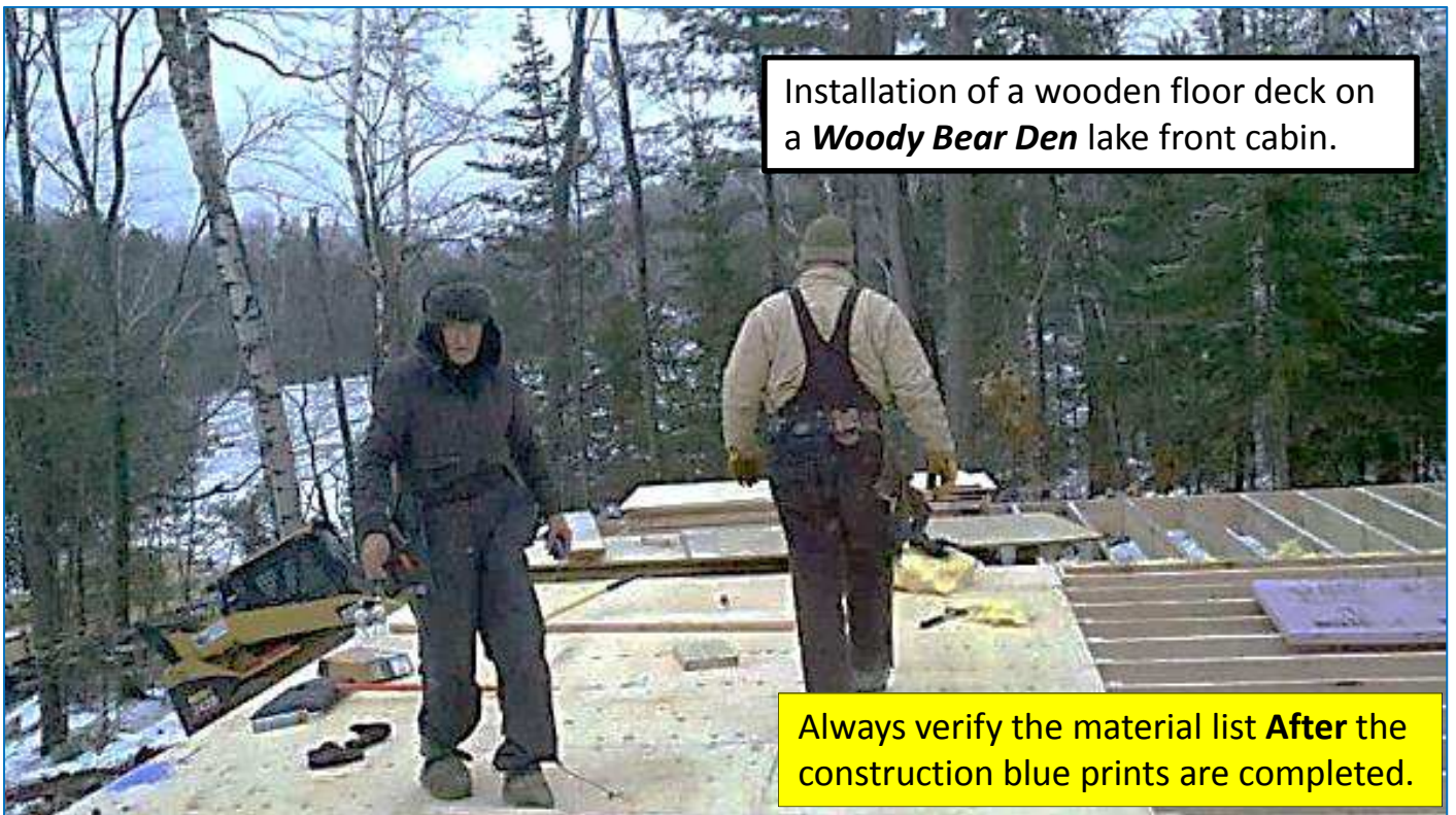
Installation of a wooden floor deck on a Woody Bear Den lake front cabin.

Materials required for the first floor wooden deck placed over the foundation See: Estimated materials for crawl space or full basement in the technical data sheets. Specify model.