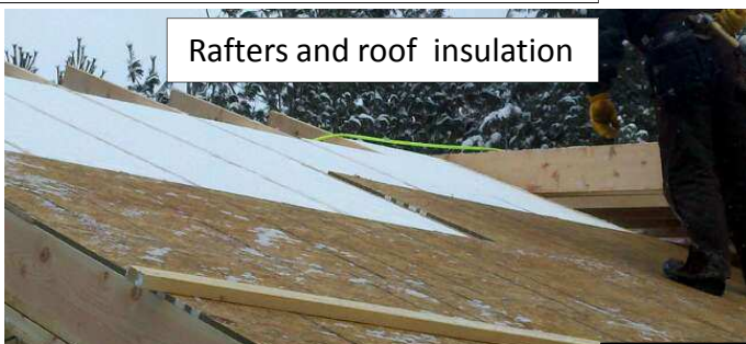
Rafters and roof insulation